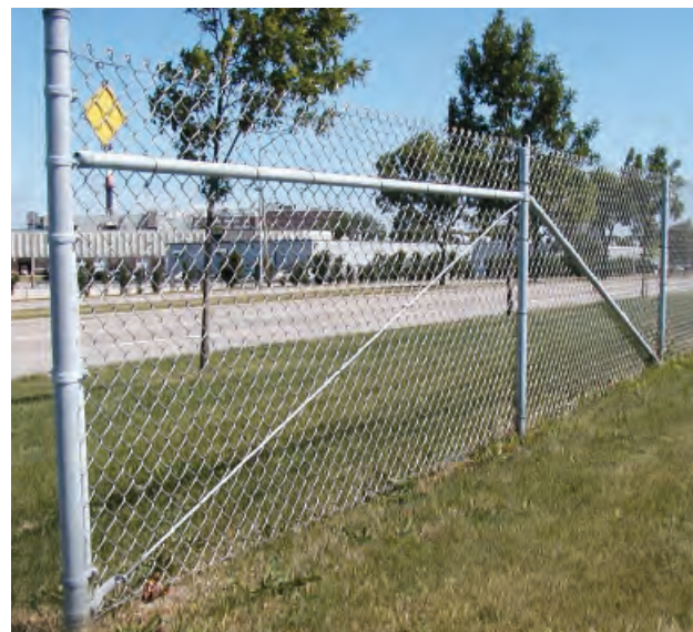
"Topless" chainlink fence with bracing