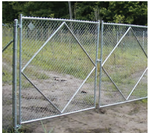
Qual Line "Diamond" gate bracing is our signature